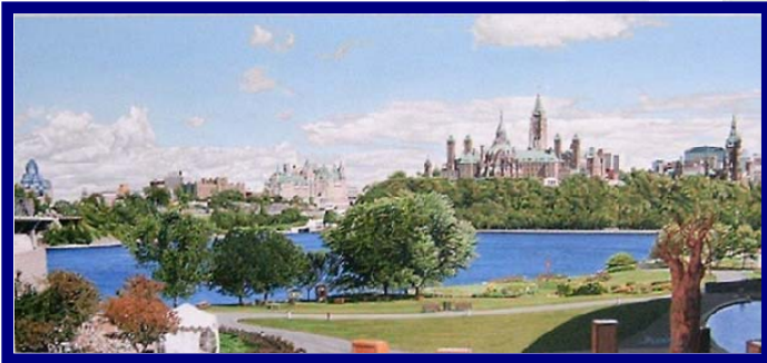
"Capital View" (#2)

Print #1 is sold out and Print #2 there is only four left