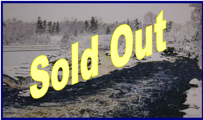
"Frosty Morning" (#1)